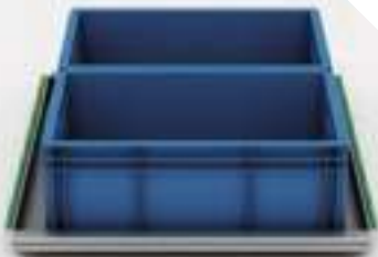
■ LxP 653x802 mm

Each tray can also be configured using tray separators and dividers, which are easily modified according to the size or quantity of the stored goods.