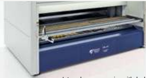
Internal access opening with dual level delivery