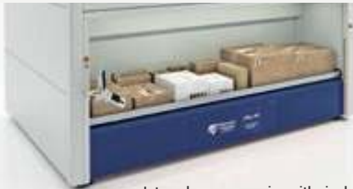
Internal access opening with single tray delivery

The dual level delivery , meanwhile, provides increased operational efficiency for storage and retrieval operations: while the operator stores and retrieves items on the first level, the internal vertical shift system continues working on the next handling operation, bringing it to the second level, therefore significantly reducing waiting times for the warehouse operator.