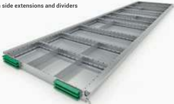
Tray with side extensions and dividers