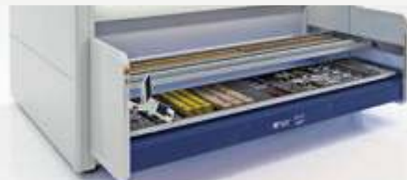
External access opening with dual level delivery