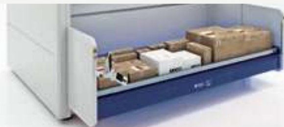
External access opening with single tray delivery